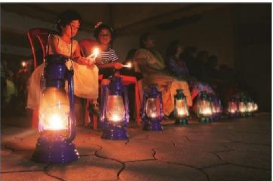
After the authorities cut power supply to the Maradu flats

court cases for alleged violations. We are yet to have a full-fledged examination,” an official said. The delay in constituting the KCZMA board has also hampered identification of CRZ violations. The board’s term expired in June and the state government sent a proposal for the new board to the Union Ministry of Environment and Forest. “The state government has sent the proposal. But the Union Ministry has to issue the notification to the effect of forming the new board. Currently, officials are conducting only a preliminary examination,” a source said. Meanwhile, with the Supreme Court set to review action taken to demolish the apartments, the state government has toughened its stand. On Thursday, power and water supply to the four complexes, which have 343 units, were snapped. The move is part of a four-month action plan to demolish the apartments. As per the action plan, the government wants residents to vacate the flats between September 29 and October 3. The agency for the demolition would be identified before October 9 and the first phase is slated to begin on October 11. Ernakulam district collector